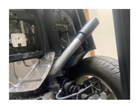
5. Finally, over axle pipe #C can be installed using the Band Clamp #D. Install the Tip to help set the over axle pipe height. (Tighten all clamps working from front to back.)