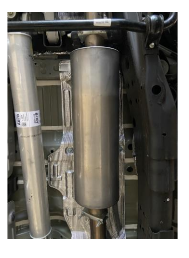
4. INSTALL MUFFLER #B ONTO HEADPIPE, USE CLAMP #D TO SECURE MUFFLER TO HEADPIPE. DO NOT TIGHTEN. USE A JACK STAND TO HOLD UP THE MUFFLER.