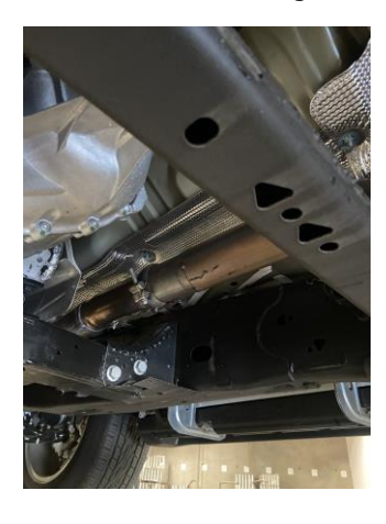
3. INSTALL HEADPIPE #A ONTO STOCK PIPE. INSERT WELDED HANGER INTO RUBBER GROMMET. (You Will be reusing the factory head pipe clamp.)