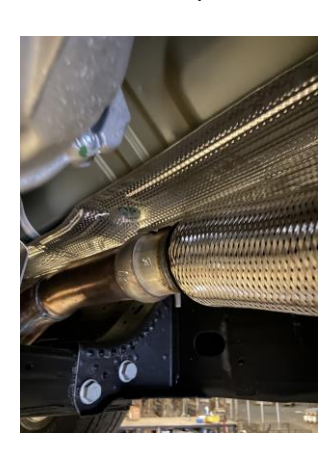
2. TO REMOVE YOUR STOCK EXHAUST, Un Bolt the back half from the flange LOCATED above the rear suspension, then loosen the front clamp and remove the remaining exhaust. (FACTORY RUBBER HANGER GROMMETS WILL BE RE-USED, USE WD-40 TO AID IN REMOVAL.)

1. Disconnect the negative battery cable before removal of OEM exhaust. This will allow the computer to reset and recognize the new exhaust. Lay out the exhaust on the floor so it looks like the drawing and compare parts with manual.